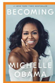
Becoming Michelle Obama