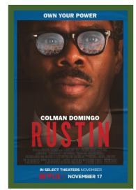
Rustin Film, 2023